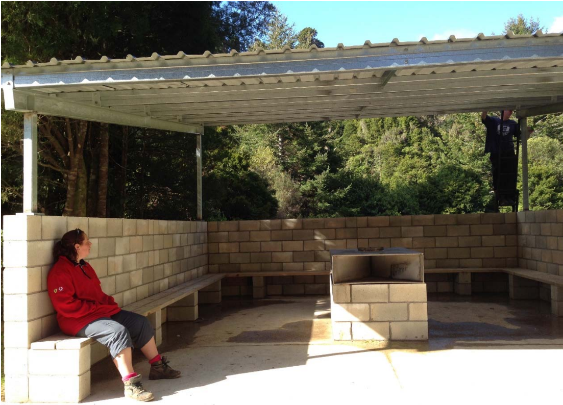
Measuring a cool 6 metres along all three walls, there's plenty of room for all