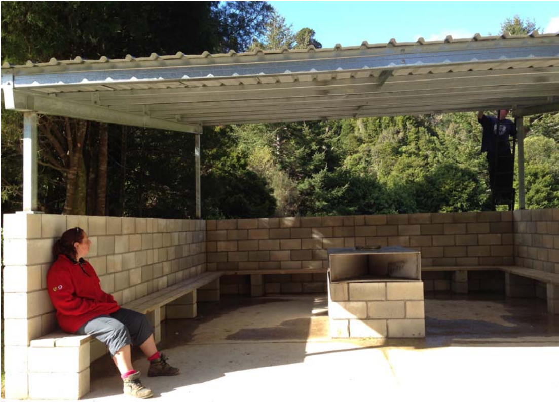
Measuring a cool 6 metres along all three walls, there's plenty of room for all